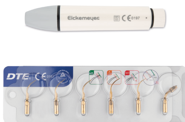
DTE Scaler Tips